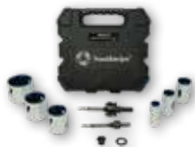
BMHSKIT9, HOLESAW BI-METAL 9-PC KIT Case Pack Qty: 1