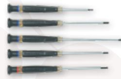
SDPCSET5, 5PC PRECISION SCRDRI SET (TRI) Case Pack Qty: 5