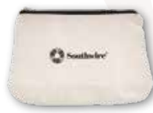
BAG12, 12" CANVAS ZIPPER BAG Case Pack Qty: 6