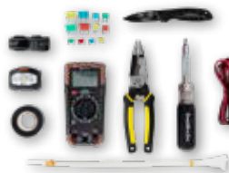
ELECTRICAL MAINTENANCE KIT Case Pack Qty: 2